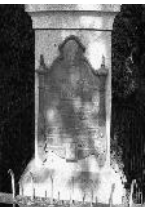
Picture-1 The 5 Canterbury Martyrs